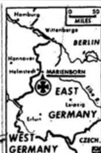
RED ROADBLOCK Where convoy was stopped.