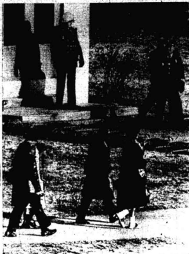
NEGRO PUPILS ARRIVE AT STRATFORD JUNIOR HIGH, ARLINGTON One of three police officers at entrance snaps scene with movie camera.