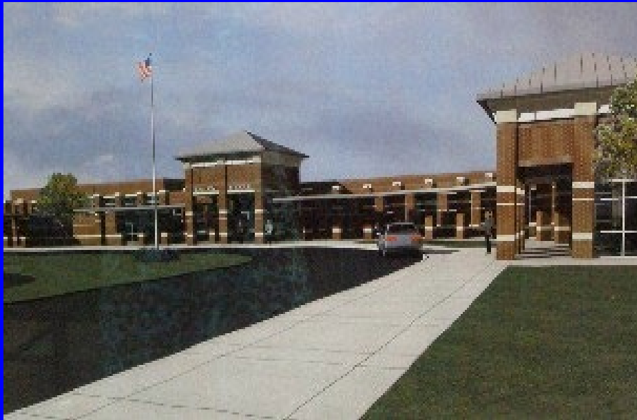
J. V. Martin Junior High School: Dillon SC